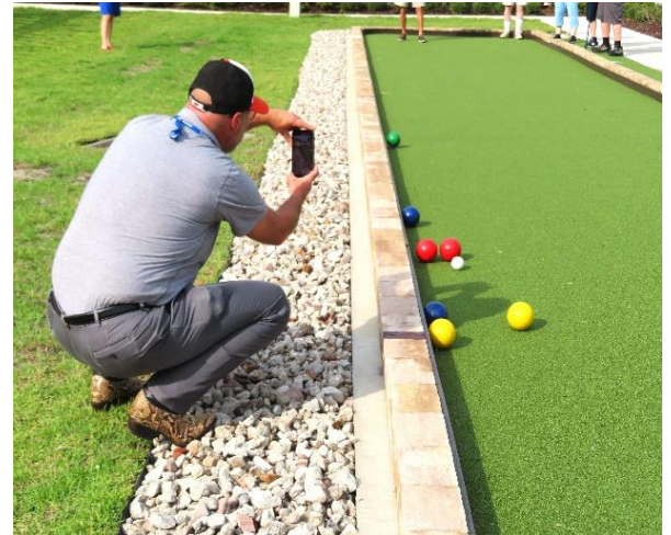
Now this is close – a tenth of an inch?