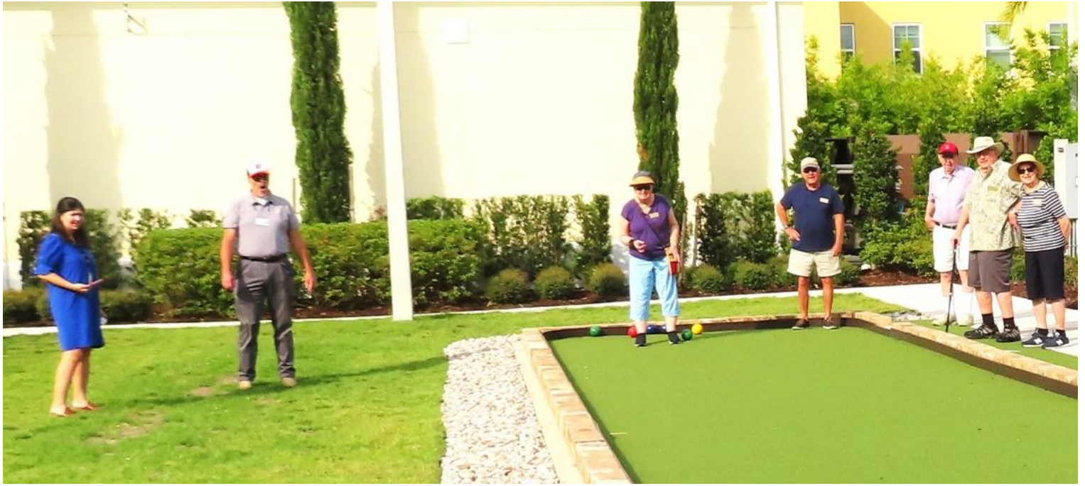
The Game is on!