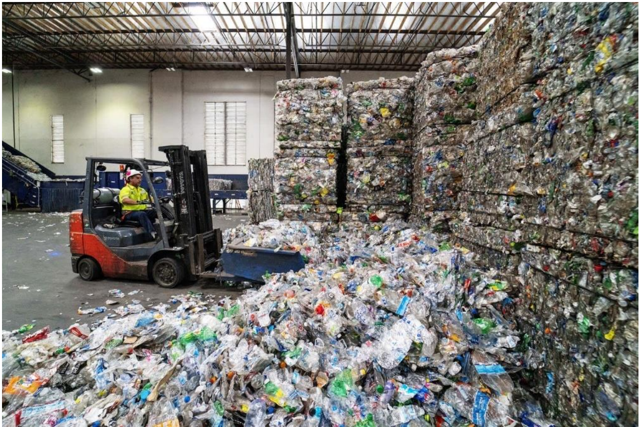
A plastics recycling plant in Vernon, Calif., in 2022