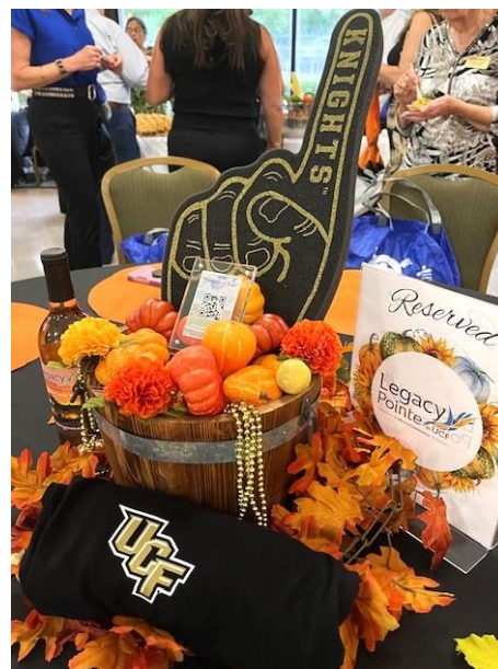
Legacy Pointe is Number 1!