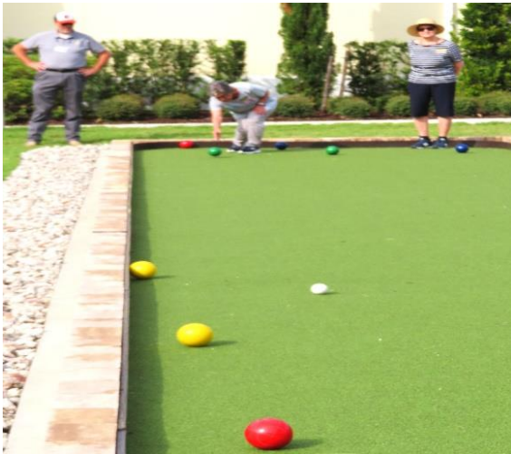
So far it is not too close ...